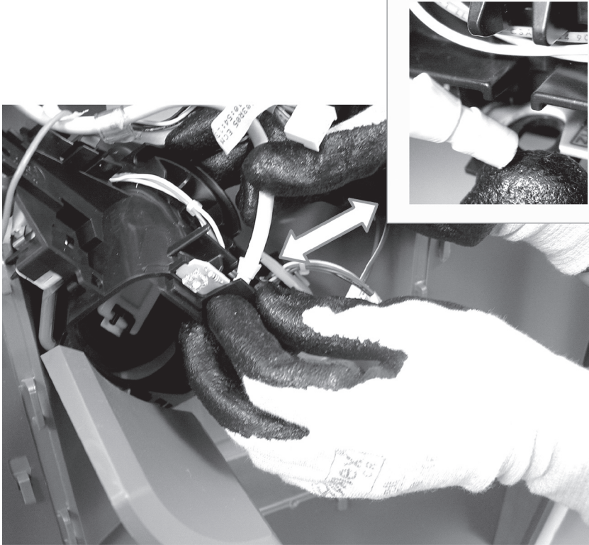
Remove the water tube from the dispenser assembly.